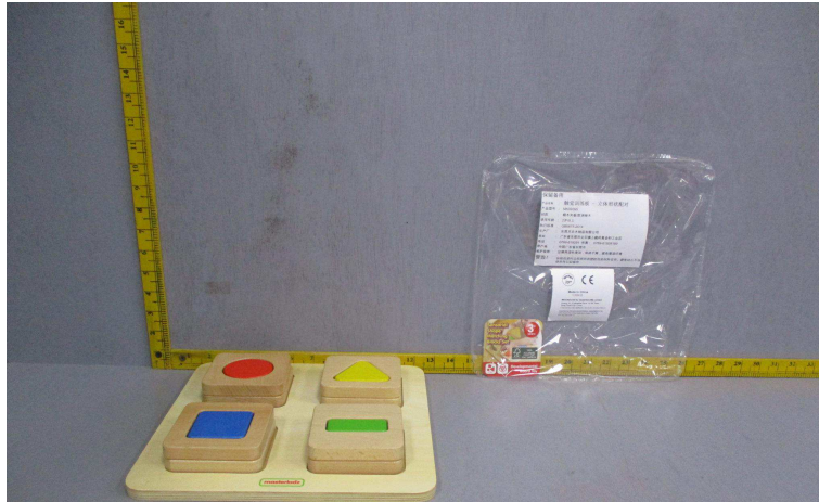
Sample Number 85200900640A1